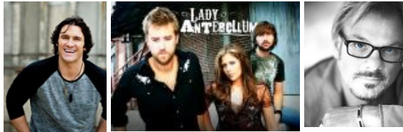
Joe Nichols Lady Antebellum Phil Vassar