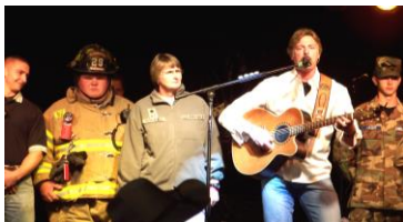
National Country Star Darryl Worley honored local heroes at 2010 festival.

Please review the sponsorship options. Complete the order form and return it no later than Aug. 31. Full payment must be received by Sept. 30. If needed, call or request a meeting with a festival official to talk about these sponsorships.